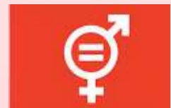
SDG 5: Gender Equality