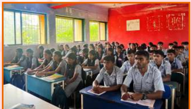
Work in progress to open a new KSK at Ashramshala, Pingalas