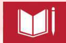
SDG 4: Quality Education