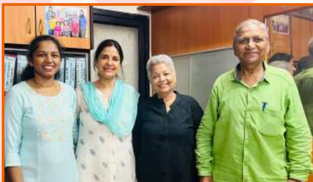
Discussion with Kayakalp's founder to expand support for girls in Pune's red-light districts

Launching Kanyathon Karshala Kendra to provide training for women in sewing, stitching, and various art forms. This initiative aims to empower women from rural areas by equipping them with practical skills that enable them to earn a sustainable livelihood and achieve financial independence.